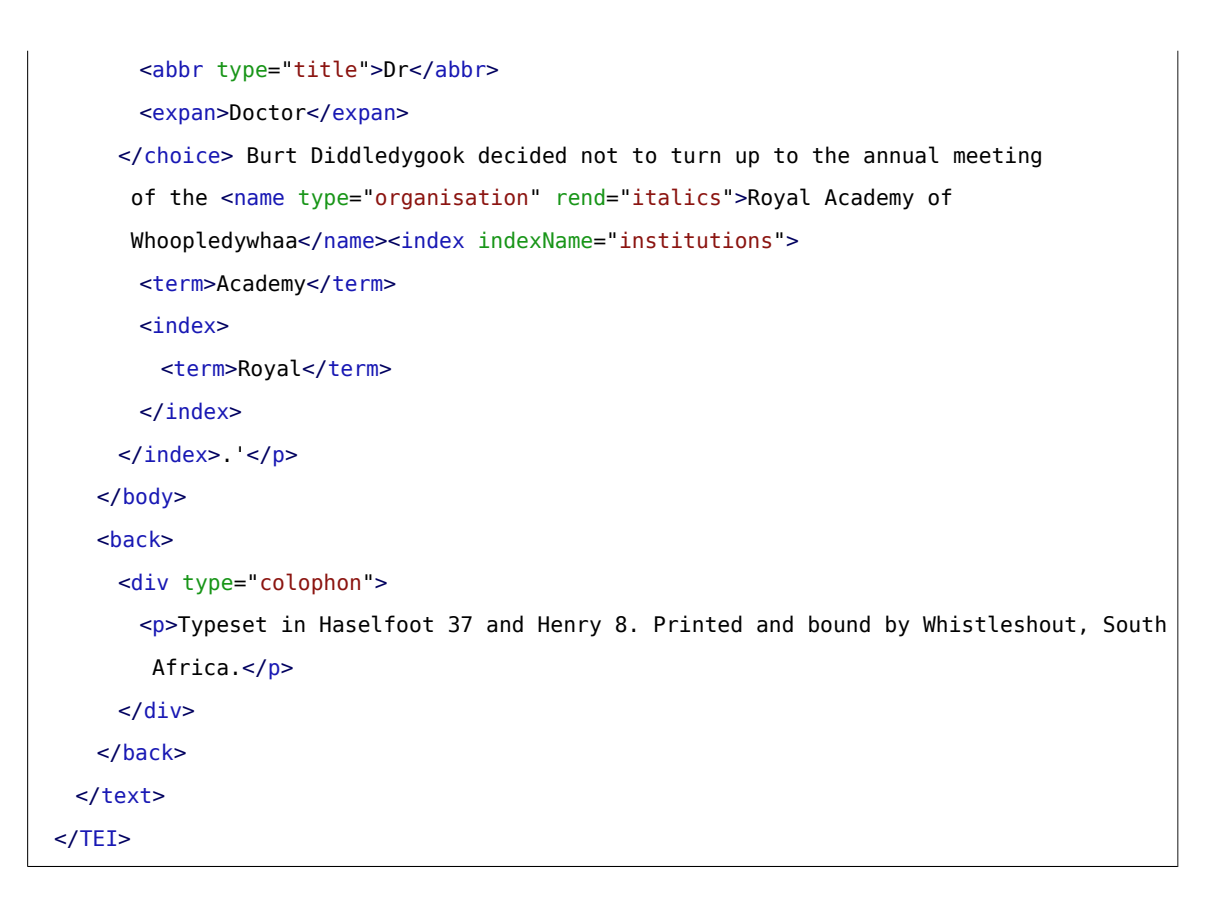
Example 52. A fully encoded transcription of the example text.